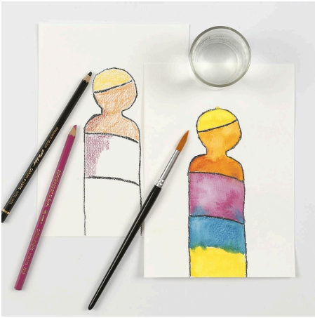
4. When sketching with normal colouring pencils (waterproof); eg:- Pablo: Paint with watercolour pencils. Here we have used Supracolor. Dip the brush in water and brush over the colours until the blend.