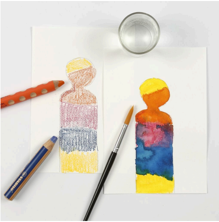
5. A tip: Children can benefit from using thick watercolour pencils, as they are more robust and easier to handle; eg:- Woody from Stabilo and Groove 3in1 from Lyra.