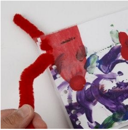
7 Gather it with chenille.