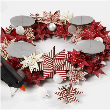
4 Attach the small stars and the small glass Christmas baubles to the wreath using a glue gun.