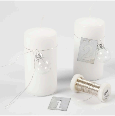
5 Tie a piece of doubled-over silver plated wire around each pillar candle. Decorate with a glass bauble and a zinc tag with Advent numbers.