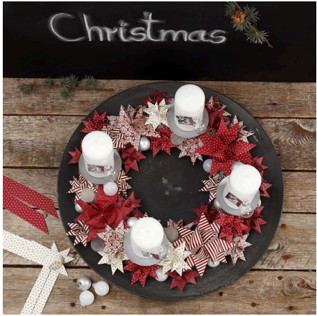
Another example -