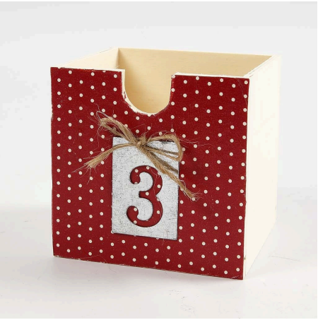
6 Untie the jute string on the zinc tag and tie a bow. A TIP: If the string curls, straighten it by wetting it with water.