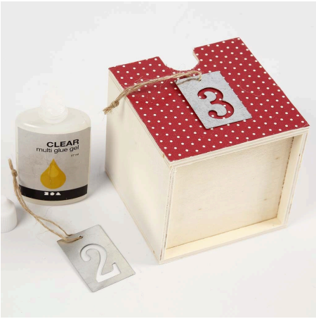
5 Glue on the zinc tag with the cut-out number.