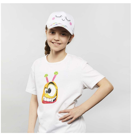
Another variant -