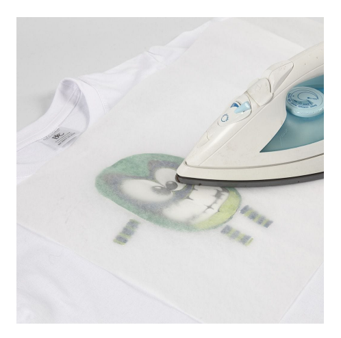
4 Place a piece of baking paper on top of the design and fix it with an iron on a medium setting.