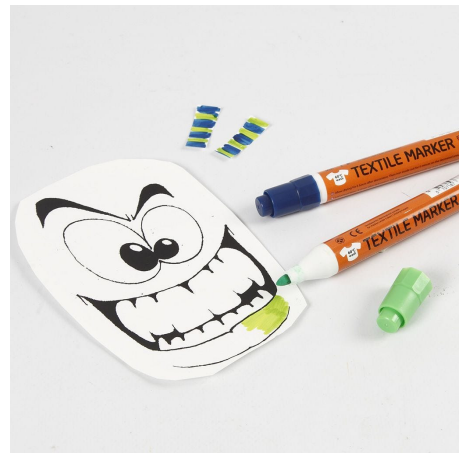
2 Cut out your chosen design and colour it in with textile markers. A TIP: the cut-away paper may be decorated and cut into your chosen shape.