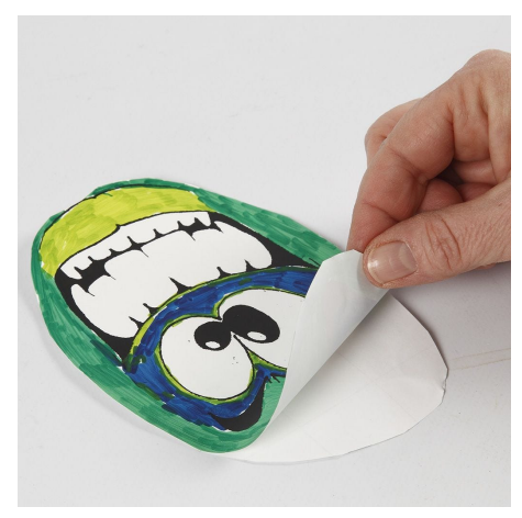
3 Separate the backing paper from the transfer and place the design onto the T-shirt.