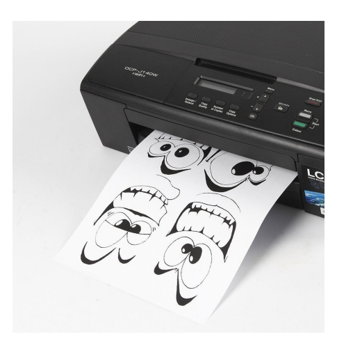
1 Place the transfer paper in an inkjet printer and print out the designs available as a separate PDF-file for this idea. NB: print onto the soft side of the transfer paper.