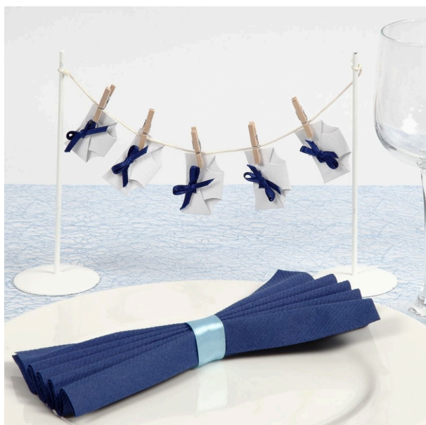
Table Decorations with Nappies on a String for a Christening