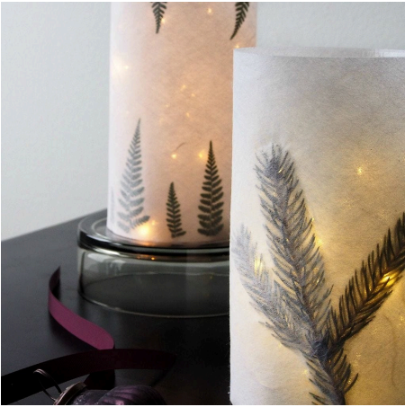
Another variant -