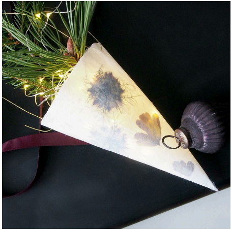
Another variant You may use the same idea for making lovely cones filled with spruce branches and LED lights.