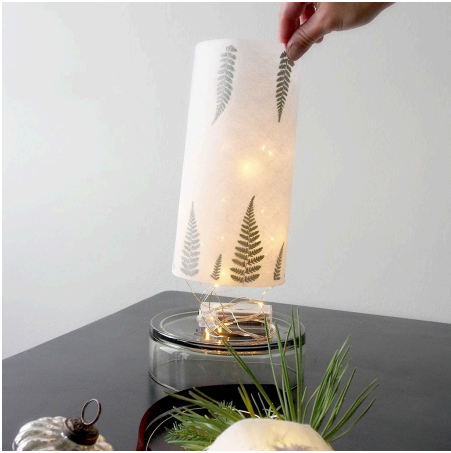
7 Switch on the LED lights and place the lantern over.