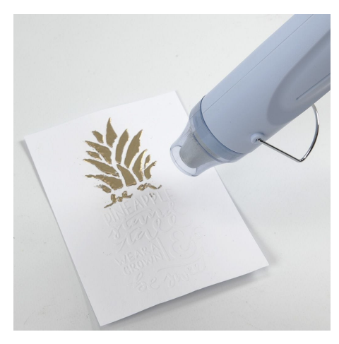
7 Use a heat gun and melt the powder. Cut a frame from the patterned card, approx. 1 cm larger (all round) than the piece of card with the embossed design.

6 Quickly sprinkle embossing powder onto the wet glue and shake off the excess powder or use a small brush.