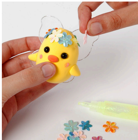
14 Sequins are attached with glitter glue like a wreath around the chick's head.