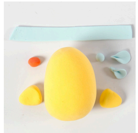
15 Make a Silk Clay ninja outfit for an Easter chick.