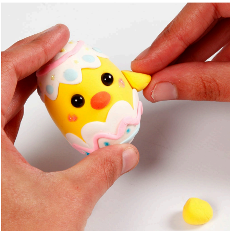
10 Model wings from Silk Clay and attach.