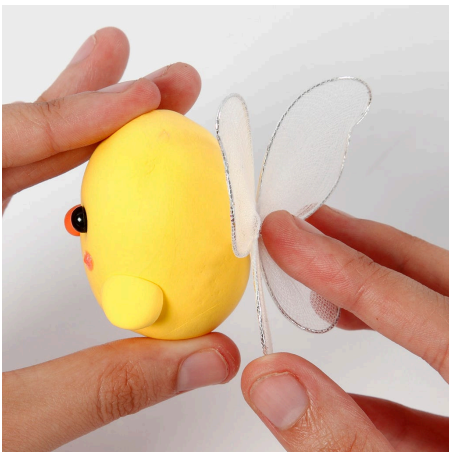
13 Dress up an Easter chick as a fairy with fairy wings which are pushed onto the back of the egg.