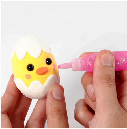
7 Apply pink glitter glue dots for the cheeks.