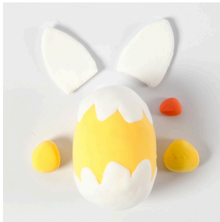
11 Transform an Easter chick into an Easter bunny with Silk Clay parts.