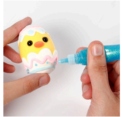
9 Decorate the egg further with glitter glue dots.