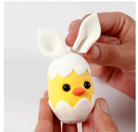
12 Attach the ears, wings, beak and eyes.