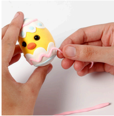
8 Decorate the egg further with long thin rolled Silk Clay sausages.