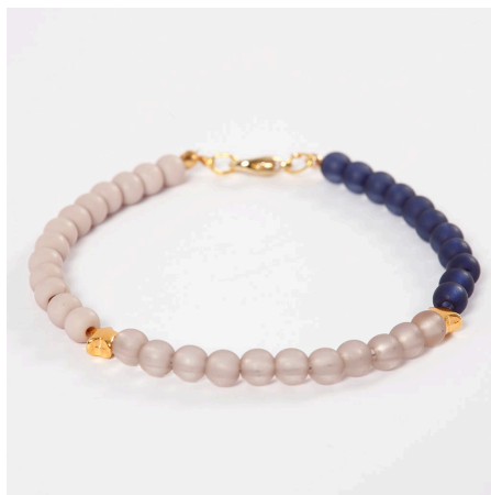
Another variant -