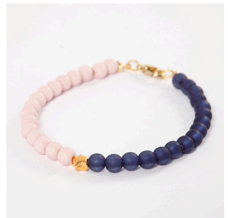
Another variant -