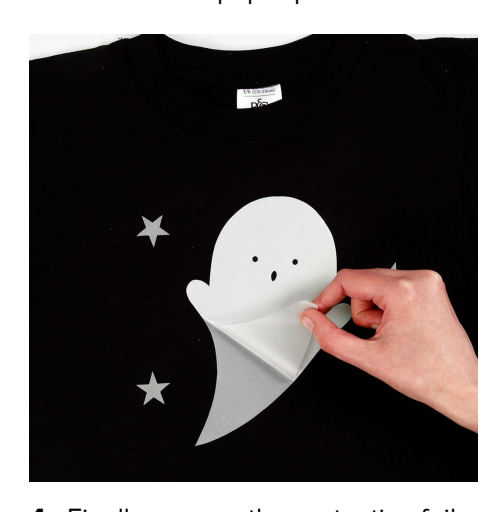
4 Finally remove the protective foil from the film.