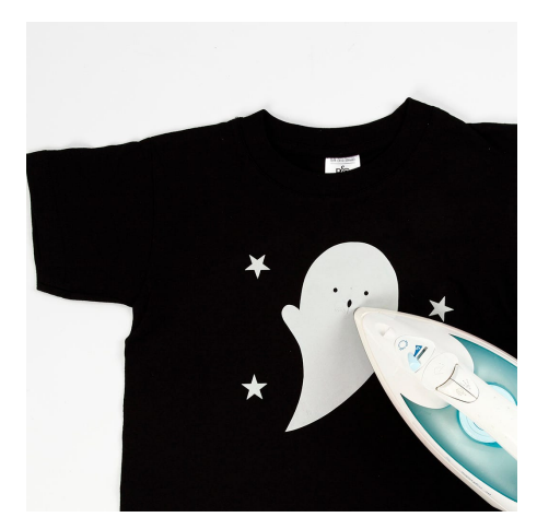
3 Place the back of the ghost and the stars on the T-shirt and iron.