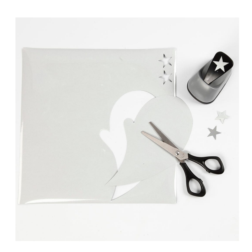
1 Print out the template which is available as a separate PDF file for this idea. Copy the ghost onto ironon reflective film and cut out. Punch out stars with a paper punch.