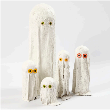
4 The ghosts (for interior decoration) will glow in the dark.