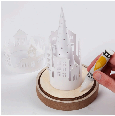
8 Place the houses in the glue. The tallest ones on the inside first around the cone and then the smaller houses. Apply more glue to the edges.