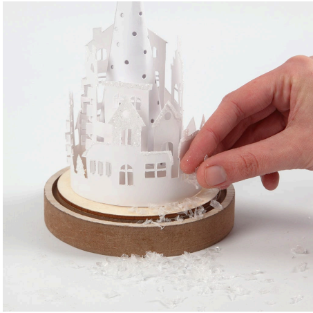
9 Sprinkle artificial snow on the wet glue.