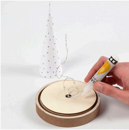
7 Apply glue to the wooden stand and place the cone over the LED light string.