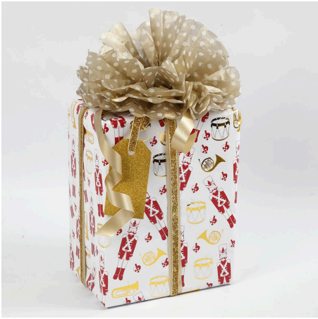
7 Attach the pom-pom onto the present.