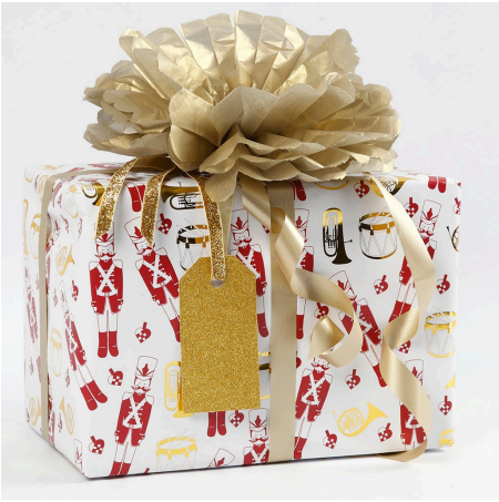
Another variant -