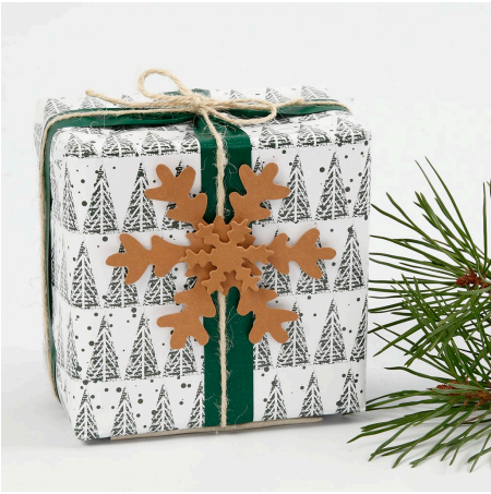
8 A present with a faux leather paper snowflake.