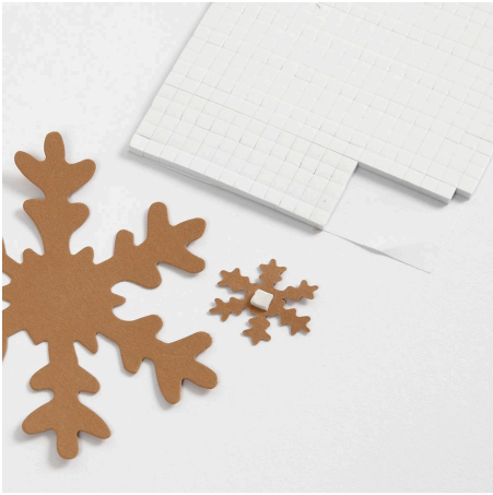
4 Attach 3D foam pads on a faux leather paper snowflake.