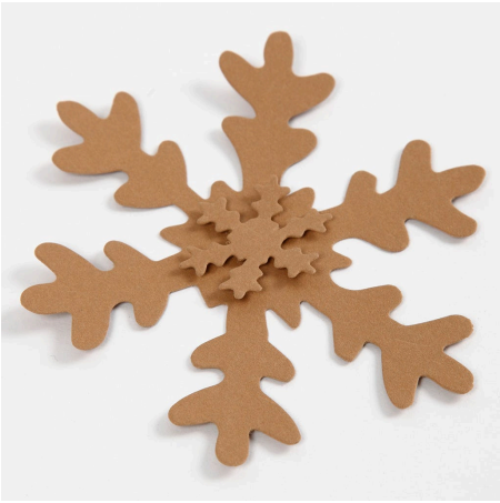
5 Assemble the snowflake and attach it onto the presents with 3D foam pads.