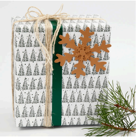
6 A present with a faux leather paper snowflake.