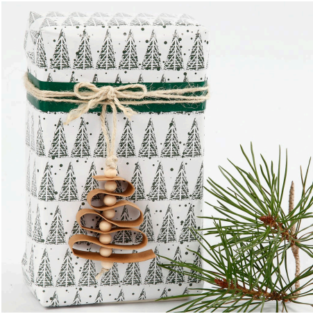
7 A present with a faux leather paper star strip Christmas tree.