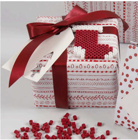
Another variant -