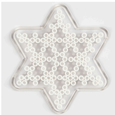
1 Template for a snowflake.