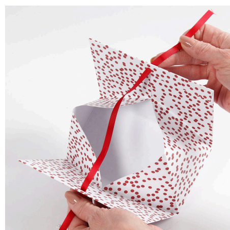
6 Fold the folding box and tie.