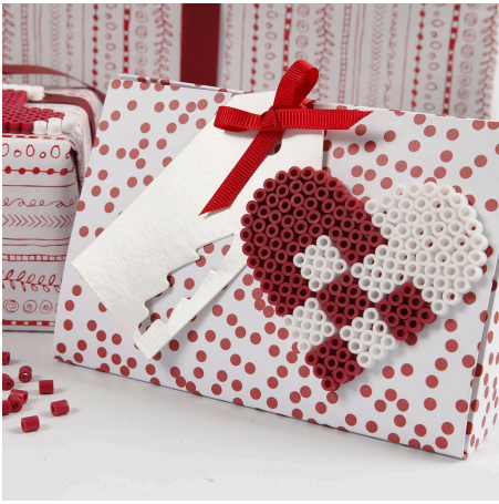
Another variant -