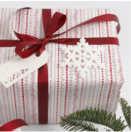
Another variant -