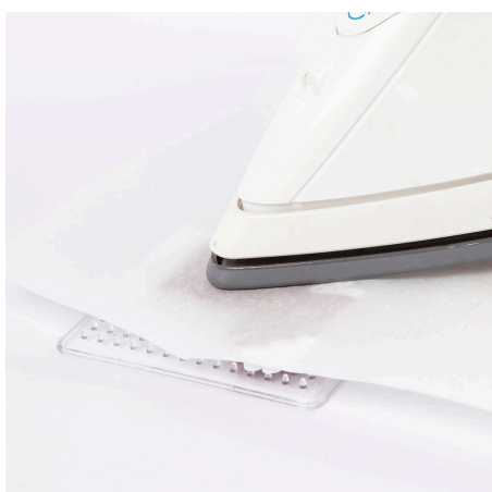
4 Iron the fuse bead designs with a piece of baking paper between the beads and the iron.