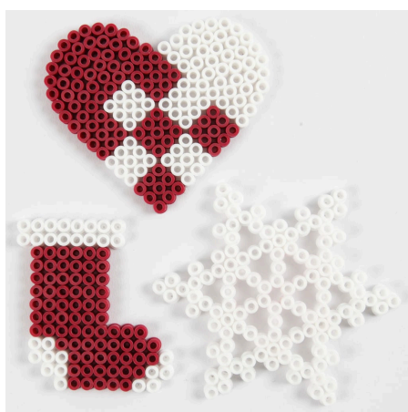
5 Finished designs.