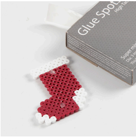
7 Attach the designs to the presents using glue dots.