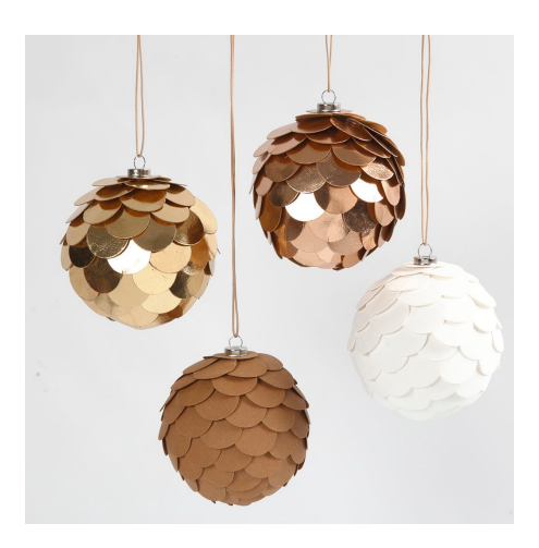
Another variant -