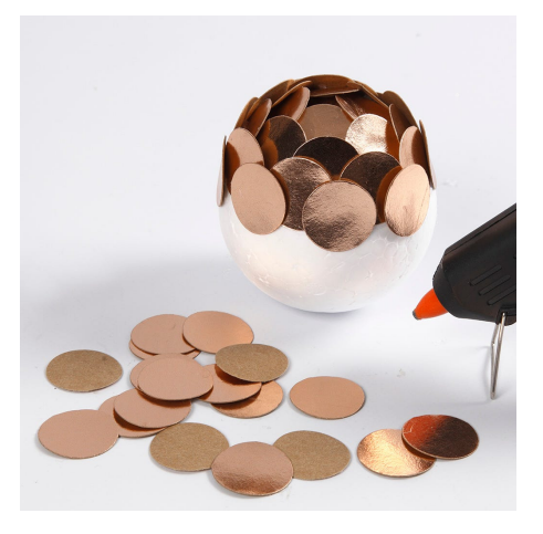
3 Glue the circles all the way around the bauble in a staggered fashion.