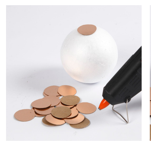
1 Punch out approx. 80 circles with a paper punch. For this bauble we have used a 25 mm paper punch. Glue the first faux leather paper circle onto the top of the bauble using a glue gun.

These cones are made from faux leather paper circles punched out with a paper punch. The circles are glued onto a polystyrene ball using a glue gun. A metal hanger with a collar is used for hanging to make the cones look like Christmas baubles. We have used rose gold, gold, natural and white faux leather paper in these examples.