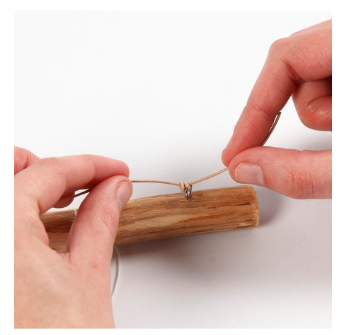
Tie a leather cord through the loops at each end of the stick for hanging.

Sew four strings and tie them around the stick.