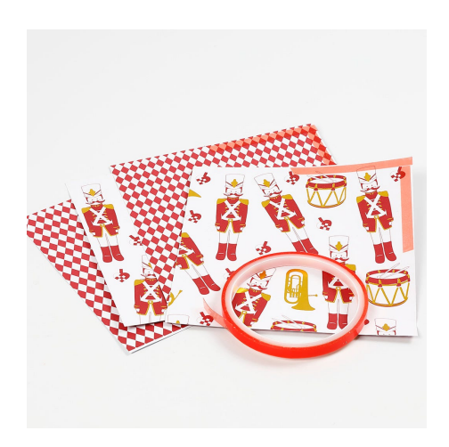
1 Cut off the white border so that the paper measures 30.5 \times 30.5 cm. Now divide the paper into four equal sized squares and attach power tape onto one corner.