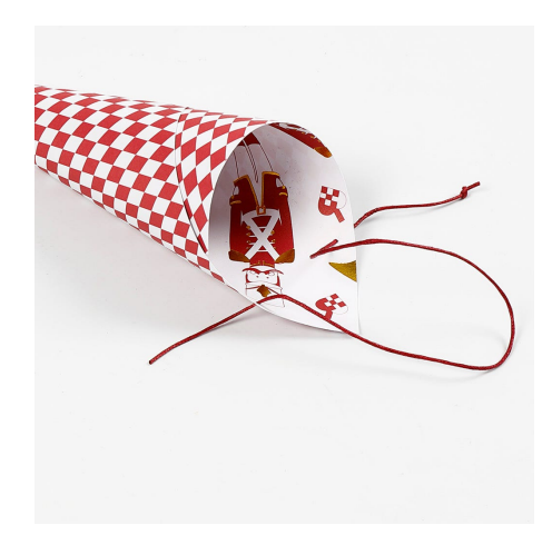
4 Thread the cotton cord through the two holes and tie a knot at both ends.