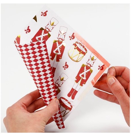
2 Roll the paper to make a cone and tape together.