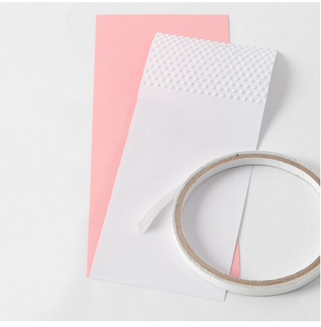
2 Cut a 7.5 x 18 cm piece of coloured card and attach the piece of white paper on top with double-sided adhesive tape.