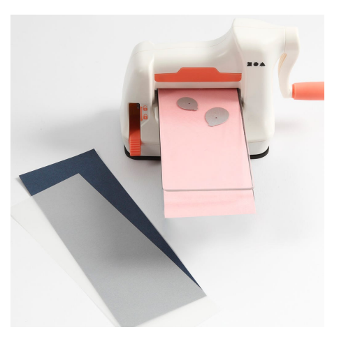
3 For punching out a card balloon; Use cutting plate C underneath + card + die + base plate B on top.