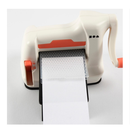
1 Cut a 7 x 17 cm piece of white paper. Place 1/4 of it onto the embossing folder between base plate B and embossing plate E. Run it through the die-cutting and embossing machine for an embossed design on 1/4 of the white paper.