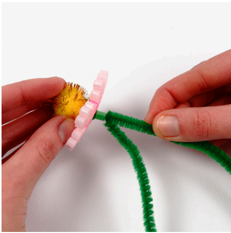
5 Push the end of the pipe cleaner up through the fuse bead, making a loop.