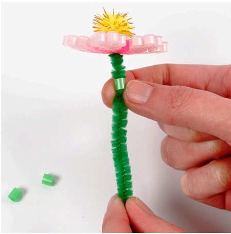
4 Thread a fuse bead onto the pipe cleaner from below.