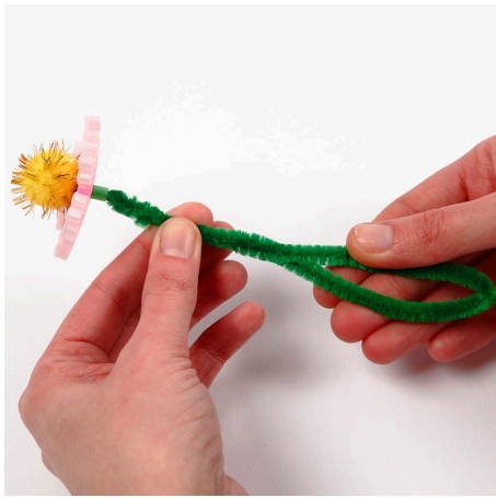
6 Twist the pipe cleaner around itself to make the stalk more rigid.