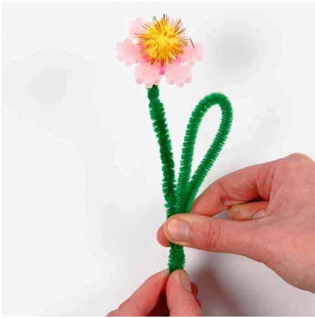
7 Shape another pipe cleaner into a leaf as shown in the photo and twist it around the stalk. Make several flowers and gather them into a bouquet.