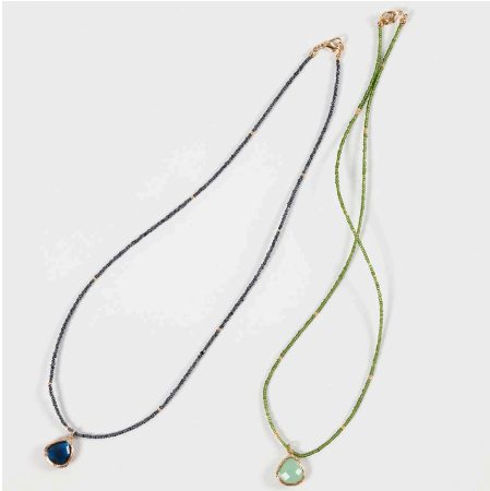
The finished necklaces -

6 Attach a pendant onto the necklace using an oval jump ring.