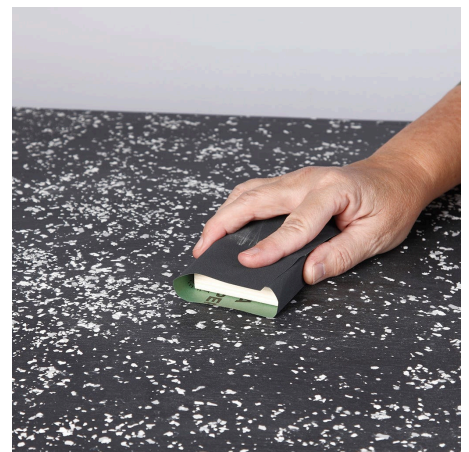
12 Sand the surface lightly with sand paper.