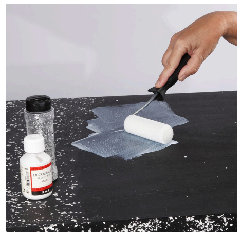
9 Now paint the podium with black craft paint. Roll on decoupage lacquer on a small area at a time using a paint roller.