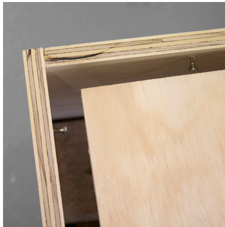
5 Place the top board onto the screws. The measurements of the top board are 60 x 80 cm.