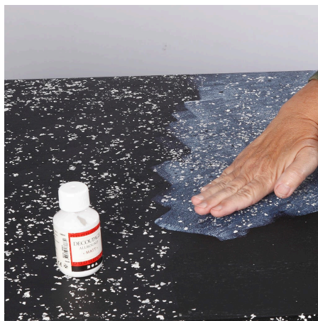
11 Smooth out the surface in order to flatten the flakes. Leave to dry.