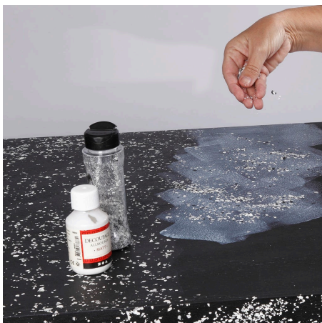
10 Sprinkle Terrazzo flakes loosely over the wet lacquer.