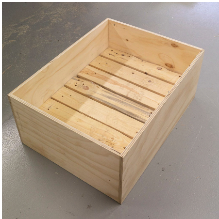
4 The podium without the top.