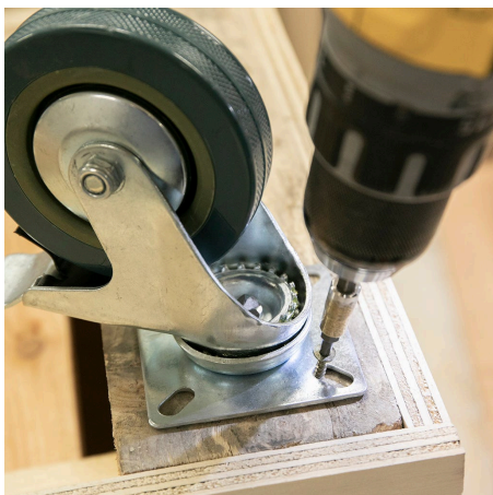
7 Screw on the casters.