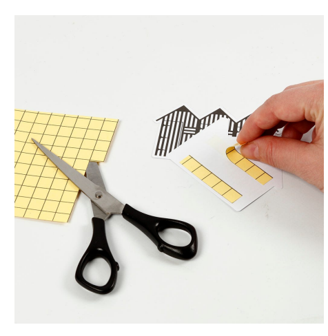
1 Cut out piece(s) of double-sided foil tape to the required size, remove the protective paper layer and attach to the back of your chosen design.