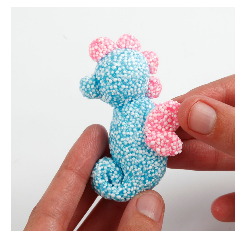
3 Assemble all the parts and roll the tail into a coil.