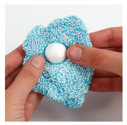
1 Make the head by rolling out Foam 2 Model Foam Clay parts as Clay flat and covering the polystyrene ball with the Foam Clay.