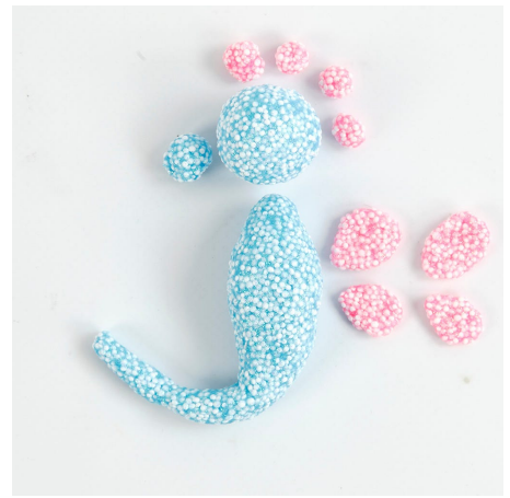
illustrated in this photo.