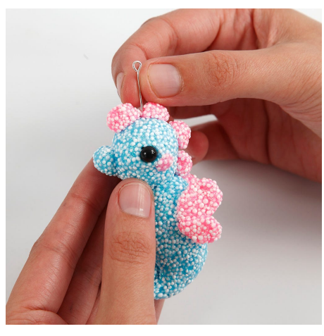
5 Push an eye pin into the top of the sea horse and feed a piece of string through the loop if you want to use it for hanging.