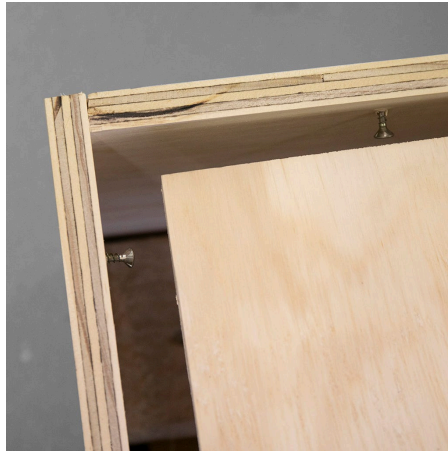
5 Place the top board onto the screws. The measurements of the top board are 60 x 80 cm.