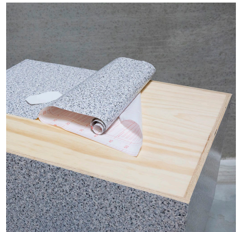
9 The self-adhesive film fits across the width of the 45 cm wide podium. Start with the sides and make sure to start away from the edge on one side, so that the foil can overlap. Finish with the top board; attach the foil 2 cm over the sides so that you can cut a notch for the corners to be stuck down over the sides.