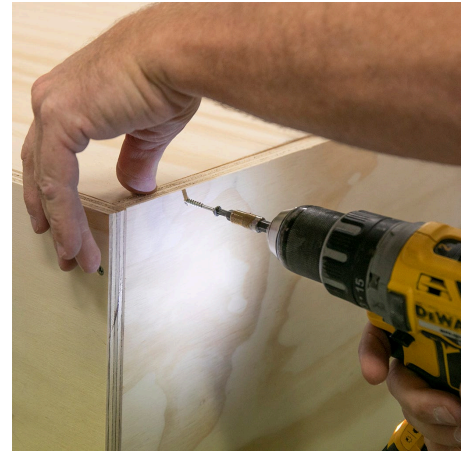
6 Screw on the top board.