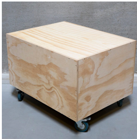
8 The podium is now finished.