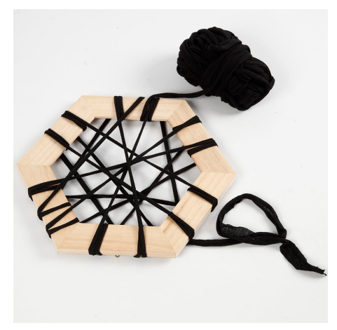
3 Wind the yarn around the frame in a random pattern.