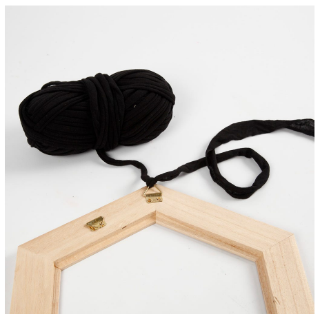
2 Tie the yarn end onto the hook for hanging.