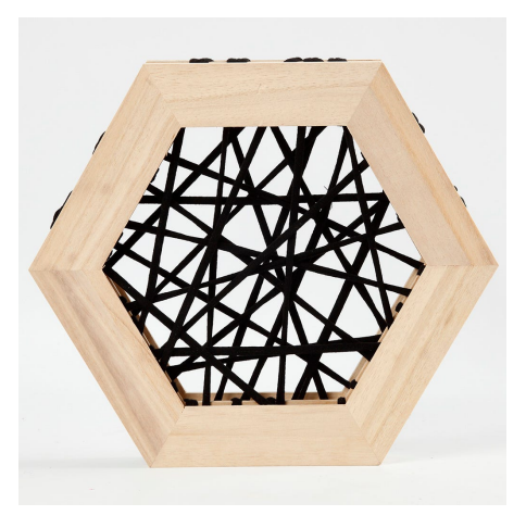
Another variant -