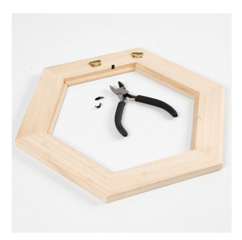
1 Start by removing the glass from the frame. Use pliers for removing the metal holding the glass inside the frame.