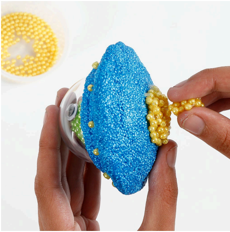
7 Make landing gear with Pearl Clay on the underside of the UFO. Leave to dry.