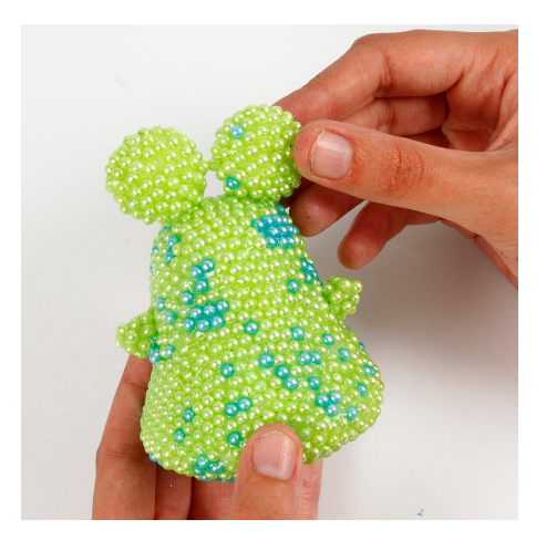
3 Roll two Pearl Clay balls and squeeze them flat before attaching them without using glue. Leave to dry