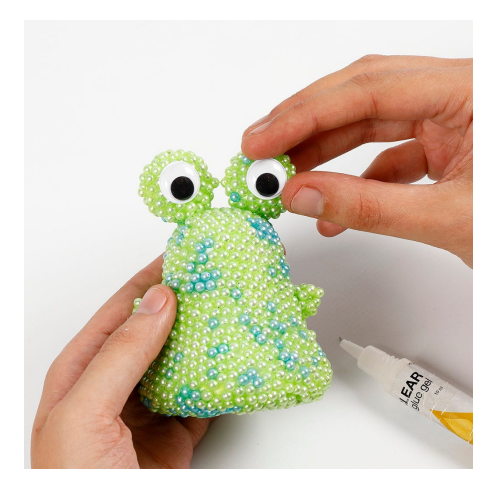
4 Attach googly eyes using Clear Multi Glue Gel.