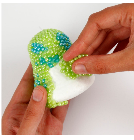
2 Cover a polystyrene bell with the mixed Pearl Clay. You may mix different colours.