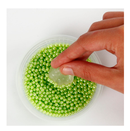
1 Mix one tub of Pearl Clay beads with 1/3 of the transparent modelling gel to make a uniform mixture.