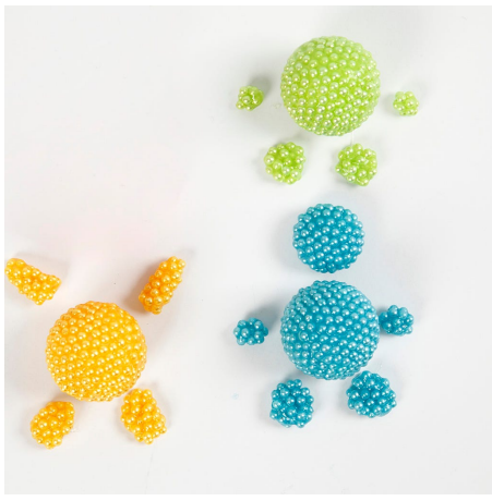
5 Cover the polystyrene balls following the same procedure.