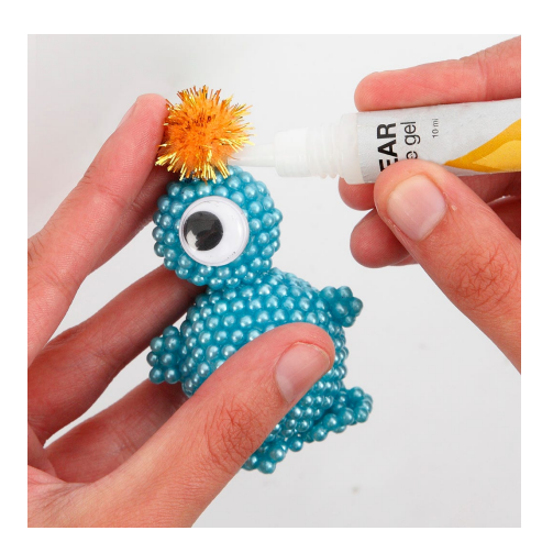
Attach a pom-pom using Clear Multi Glue Gel.