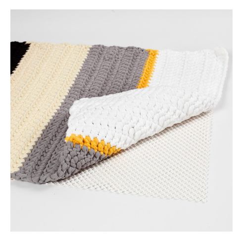
A tip: Cut a piece of non-slip PVC mesh the same size as the rug. This will make the rug lie securely on the floor.