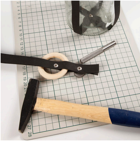
13 Set the bottom rivet first, attach a wooden ring and set the top rivet.