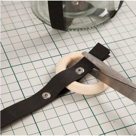
14 Trim the excess faux leather paper weaving strips.