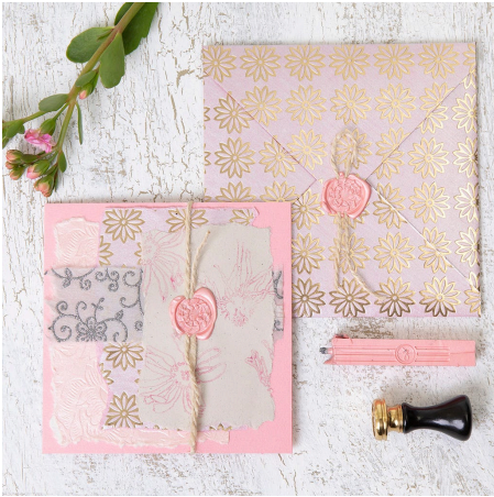
Another variant -

12 Secure the envelope with wax and seal on top of a piece of doubled-over natural hemp. You may decorate the front of the envelope with kraft paper and masking tape stamps.