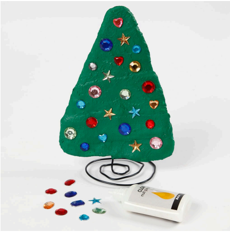
5 Attach rhinestones with liquid glue (Clear Multi Glue Gel).