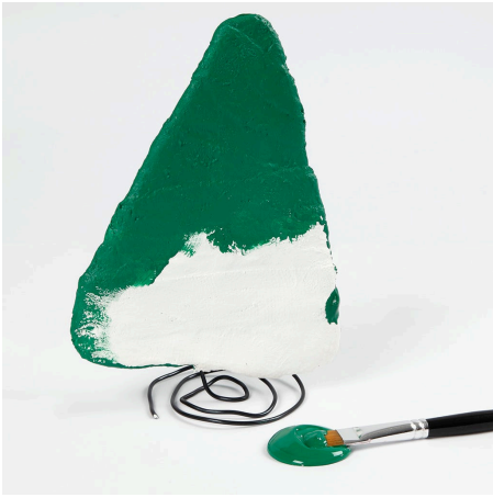
4 Paint the hardened gauze bandage shape with Plus Color craft paint and leave to dry before the next step.