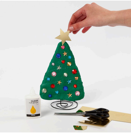
6 Cut out a star from gold metallic foil card and attach it onto the top of the tree using Clear Multi Glue Gel.