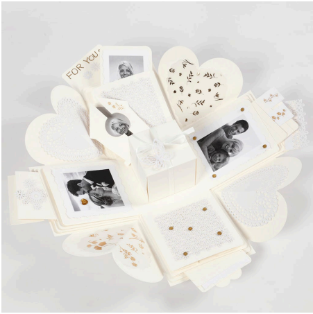
Another variant -