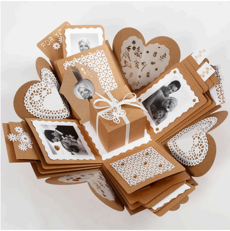
Another variant -