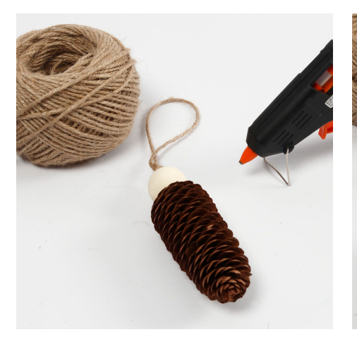
1 Large angel: Glue a wooden bead onto the pine cone with a glue gun. Make a large loop for hanging, tie a knot and glue this on top of the wooden bead.

Make these angels with a pine cone body and large wooden beads for the head. The hair is made from untwisted natural twine and the wings are fabric wings or natural twine. Everything is glued together with a glue gun.