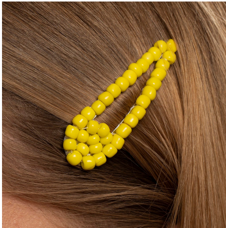
Another example -