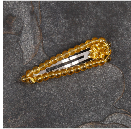
9 The finished hair clip.