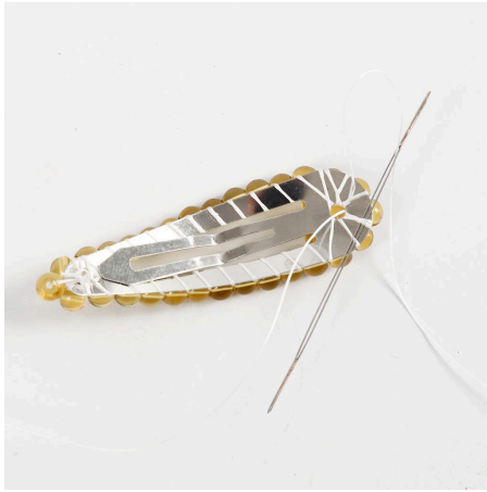
8 Secure the end of wire on the back of the hair clip.