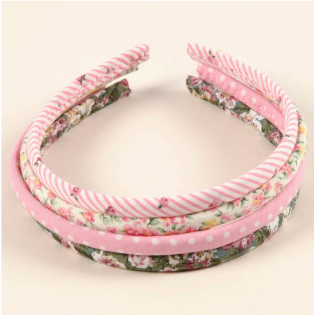
Another variant -

6 Fold the fabric towards the middle on the back of the hair band and sew it together.