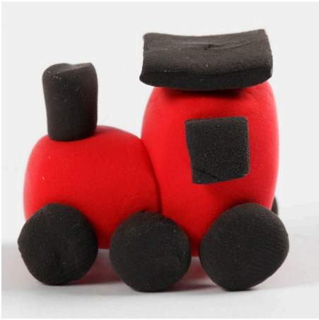
7 Make this lovely train. The following two steps show how to make the train.