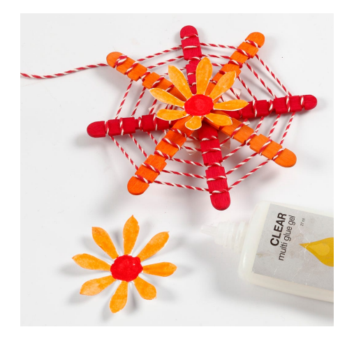
4 Decorate the hanging decoration with the flowers or other amusing small decorative items, like googly eyes or beads. Attach everything with a transparent glue.