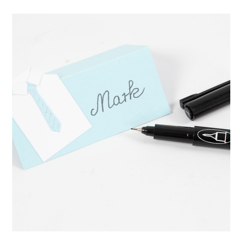
4 Write a name with a marker.