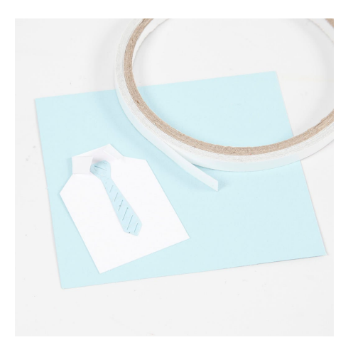
3 Attach the tie onto the shirt and fold the collars in. Glue the collar in place and attach the shirt onto the place card using double-sided adhesive tape.