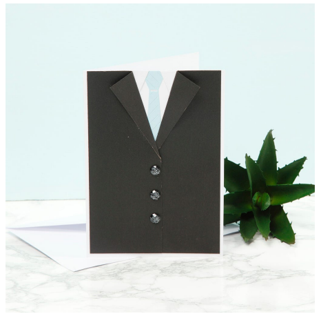
5 See our matching ideas: Invitation 15692.