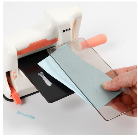
2 Punch out a tie from patterned paper using the small die in the diecutting and embossing machine.