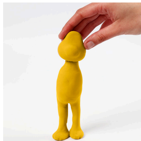
6 Leave the body and the neck to dry slightly before attaching the head, thus avoiding squeezing the body. Use a small blob of fresh Silk Clay for attaching the head onto the neck.