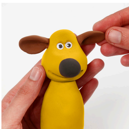
10 Model ears from brown Silk Clay and attach them onto the head.