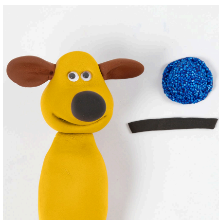
11 Make Bitzer's hat from blue Foam Clay, modelling it into a semi circle. Model a collar from black Silk Clay.