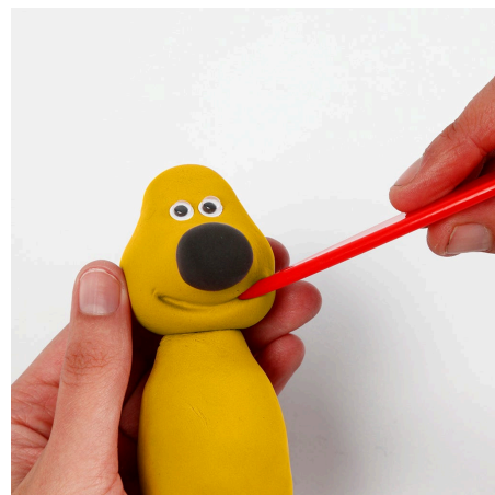
9 Make the mouth using a modelling tool.