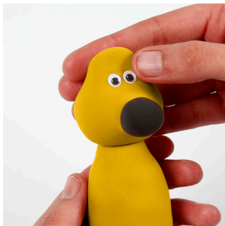
8 Attach self-adhesive googly eyes.