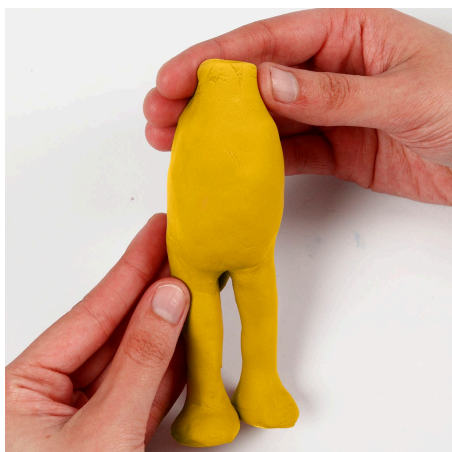
4 Model a neck.