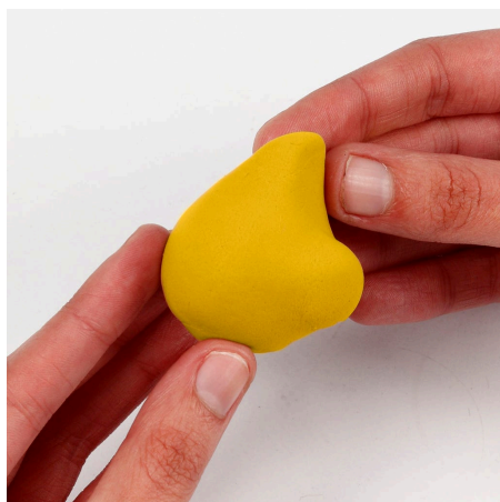
5 Model Bitzer's head from Silk Clay.