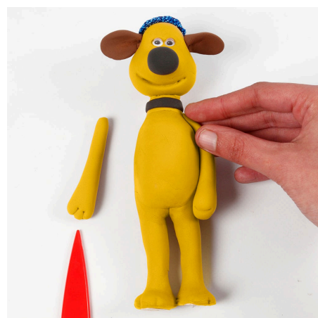
12 Attach the hat, the collar and the arms. Make details on the paws using a modelling tool.