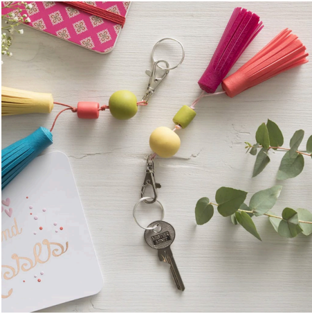
Other variants -