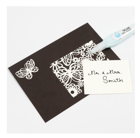
Decorate the envelope with laced card and white card for the name and address.