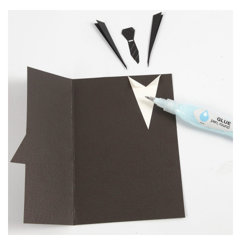
Trim the tie to fit the shirt and glue the cut-out parts onto the right-hand side inside the greeting card.