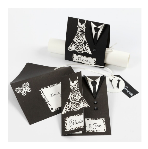
10 See our matching ideas: Place card 15657 and Menu card 15658.