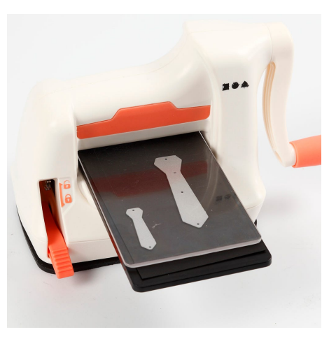
Punch out a tie for the groom.