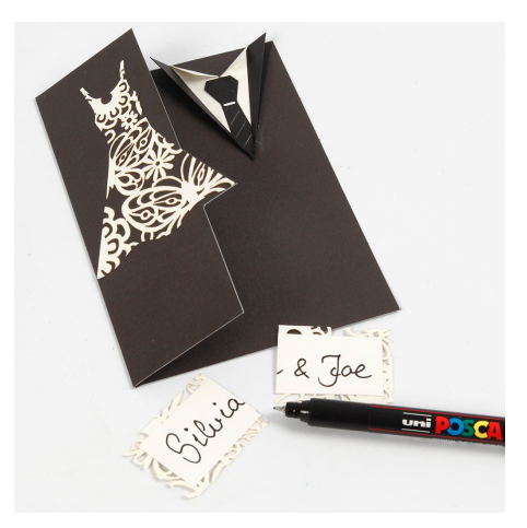
Cut a piece of white card for the bride's and the groom's names. Glue it onto a piece of laced card. Cut it in half and glue both halves onto the front of the greeting card.