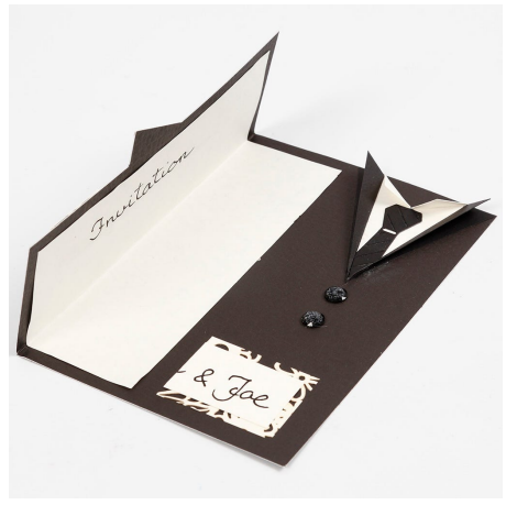
Attach self-adhesive rhinestones onto the shirt for buttons. Print or write the actual invitation on off-white paper and glue it onto the inside of the greeting card as shown in the photo.