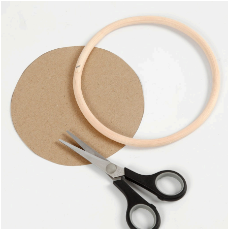
4 Draw and cut out a paper circle with the same measurements as the inside of the bamboo ring.