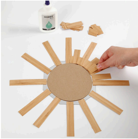
5 Place the paper circle template in the middle of the mirror plastic octagon and attach the pieces of wood veneer with hobby glue as shown in the photo. First distribute the longest pieces of wood veneer equally. Then distribute the middle sized pieces in the spaces and finally the shortest pieces all the way around. Remove the round paper template and glue on the bamboo ring as a frame. You may place a heavy object on top whilst drying.