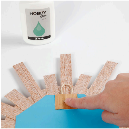
6 Attach a hanger onto the back of the mirror using hobby glue, a piece of natural twine and a small wood veneer square.