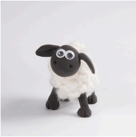
Another example -