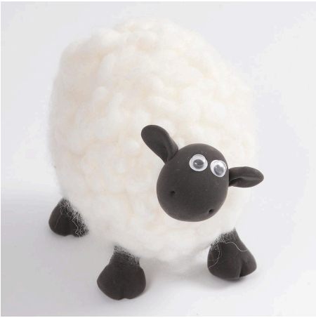
Another example -