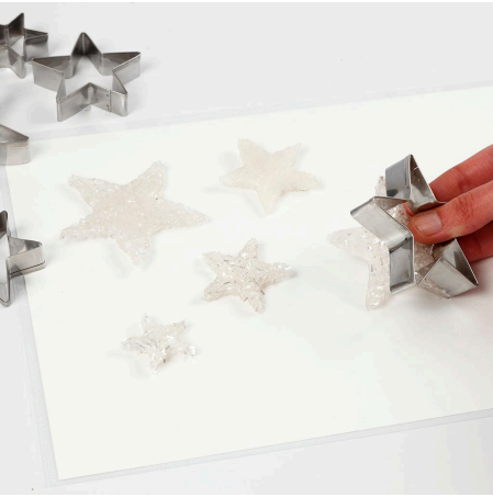
6 Carefully remove the star from the shape cutter when dry.