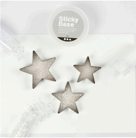
5 Leave the star to dry for approx. 24 hours. The drying time depends on the thickness of the star. In this photo you can see the different kinds of artificial snow glitter mixed with Sticky Base.