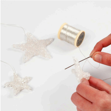
7 Thread a needle with silver thread for hanging and push the needle through one of the star points.