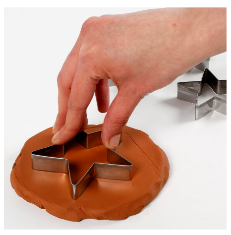
2 Push the shape cutter all the way through the clay and remove the excess clay around.