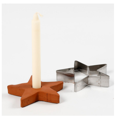
5 Leave the candle holder to dry for approx. 24 hours.