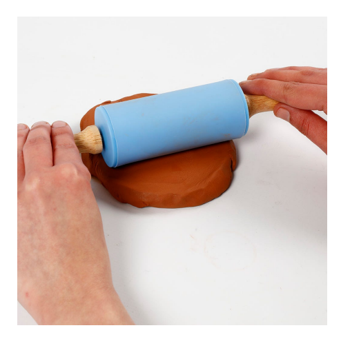
1 Knead a lump of self-hardening clay thoroughly and roll it flat with a rolling pin until the clay is the same depth as the shape cutter.