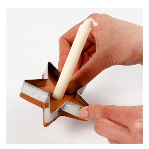
4 Carefully push the clay star with the candle out of the shape cutter without breaking it.