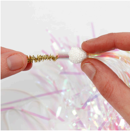
4 Attach a small blob of Foam Clay around one end of the rolled-up lametta with the pipe cleaner inside, thus securing the lametta around the pipe cleaner.