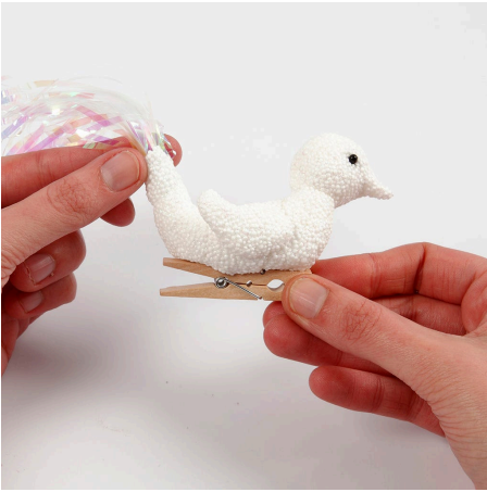
5 Make a hole in the bird's tail and push the pipe cleaner with the lametta into the tail. Model Foam Clay around the hole to complete the tail.