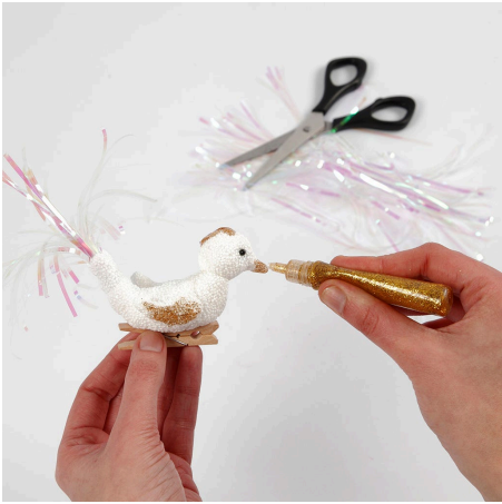
6 Trim the tail and decorate the bird with glitter glue.