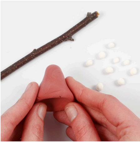
4 Model the toadstool's cap and the toadstool's spots from Silk Clay.