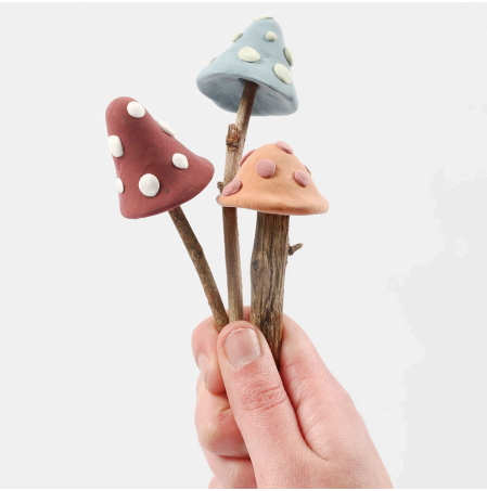
6 Here are the finished toadstools.