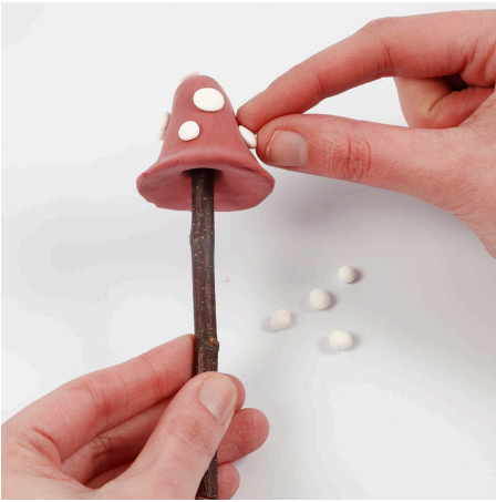
5 Push the cap onto a branch and decorate the toadstool's cap with white spots.