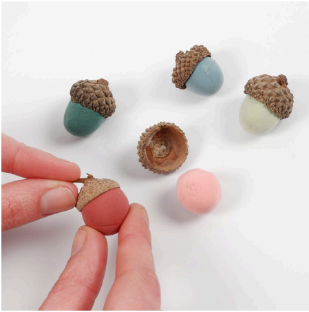
7 Roll the "nuts" for the acorns from Silk Clay and push them into the cup. Silk Clay will stick to wood, papier-mâché etc. as long as it is moist.