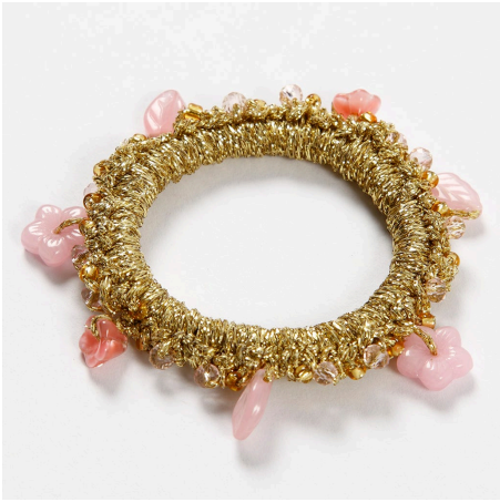
Another variant -