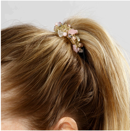
Another variant -